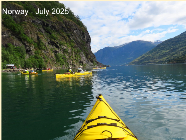
Norway - July 2025