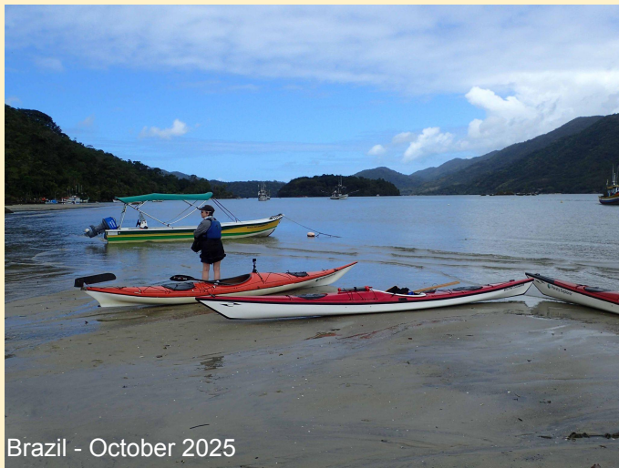
Brazil - October 2025