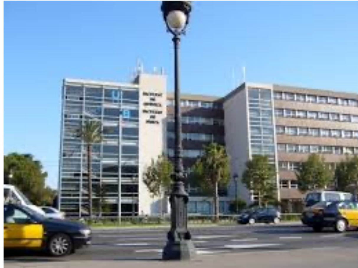
High Energy Physics MSc- ETH Zurich (M1) 2023-2024