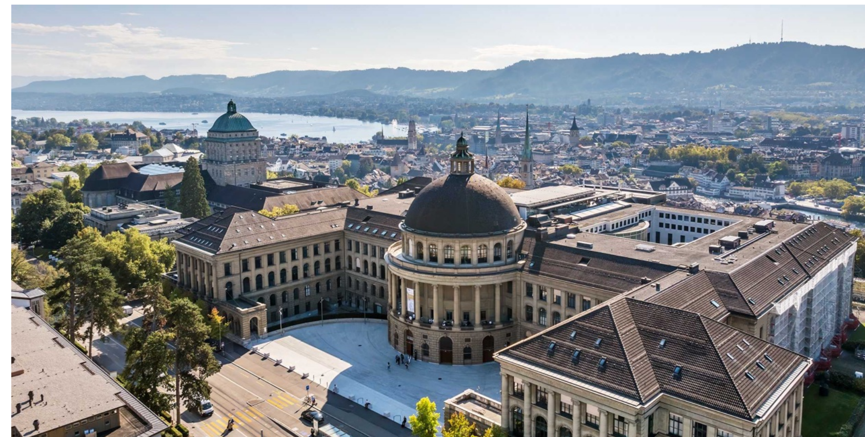
Bachelor's degree in Physics- Universitat de Barcelona 2018-2023