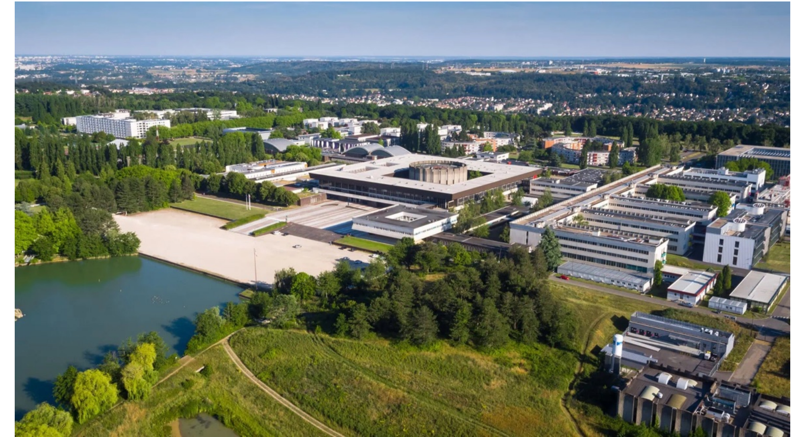
High Energy Physics MSc- École Polytechnique (M2) 2024-2025