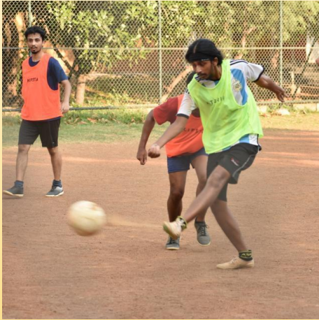
Football (Playing & Watching)