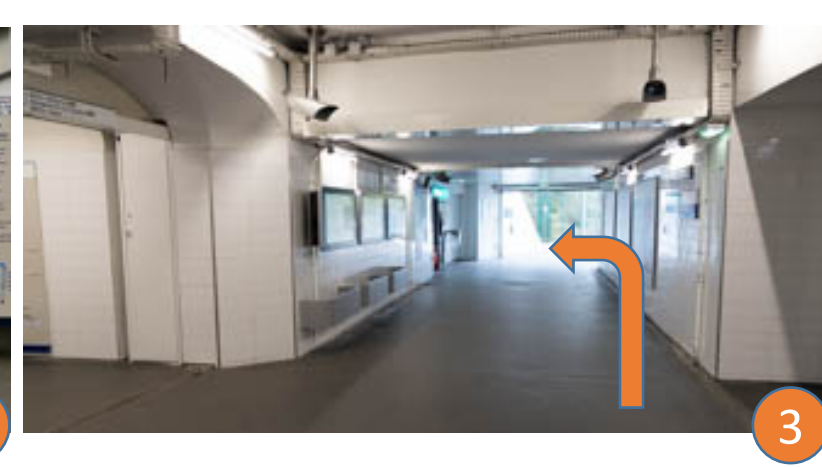
Exit of RER: Paris